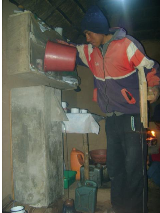
Figure 1: A domestic bio sand water filter being used in Peru.

If the source water has been tested and found to be safe then things are obviously going to be easier. However, there are ways of improving the source if it is not safe; covering wells with a concrete slab, keeping animals away from the source, ensuring rubbish is not thrown down the well, the type of bucket used to extract water etc. Tubewells with handpumps are usually quite well protected from contamination if maintained properly. Other sources such as surface water are not safe without treatment.