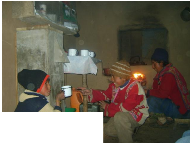
used in Peru. Photo:

Practical Action has used bio-sand filters in Peru and in Bangladesh and they have been promoted in many other countries by other organisations. The filters were first used in Haiti in 1999 and their usage is spreading throughout the country as people become more aware of their effectiveness. The following description is of the domestic scale bio-sand filter used in Bangladesh.